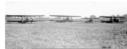
Left: A December 10, 1928 photo of Thompson Field depicting what appeared to be several Army twin-engine biplane bombers along with a smaller single-engine biplane.

Right: An undated (but presumably 1928) photo of Thompson Field, of a Army single-engine biplane. This short-lived small airport was located along the banks of the Pamunkey River.